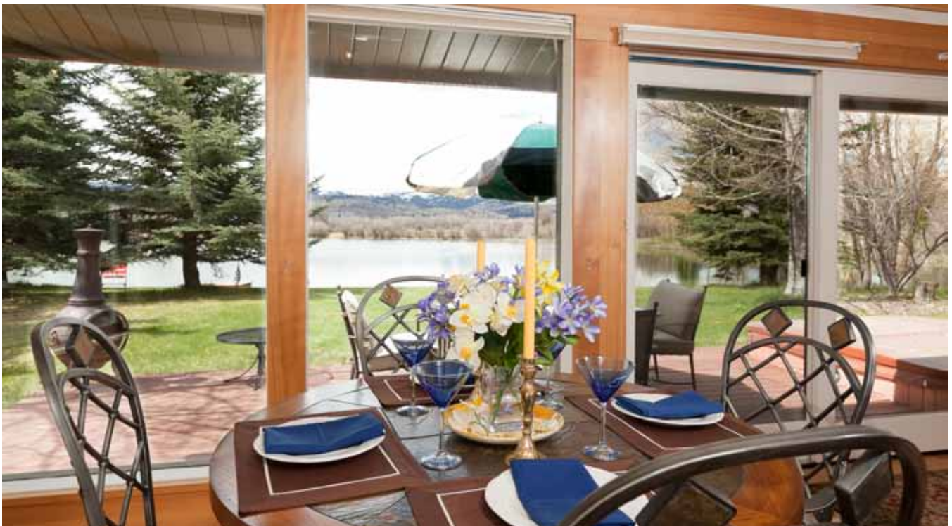
The great room includes an open kitchen, recently remodeled with granite countertops, in-floor heat, at-counter seating, and a breakfast nook surrounded by windows.