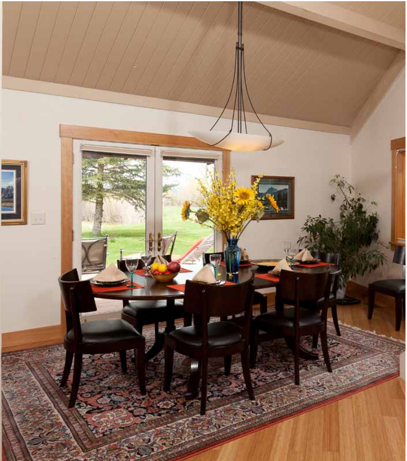
A spacious dining area that accommodates a large dining table is situated by windows and glass doors that access a large deck.