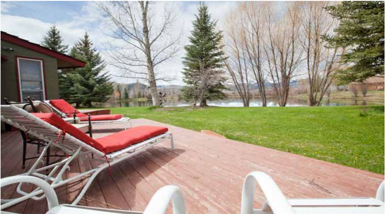
A spacious deck wraps around the south side of the house providing wonderful spaces for relaxing or outdoor entertaining by the lake.