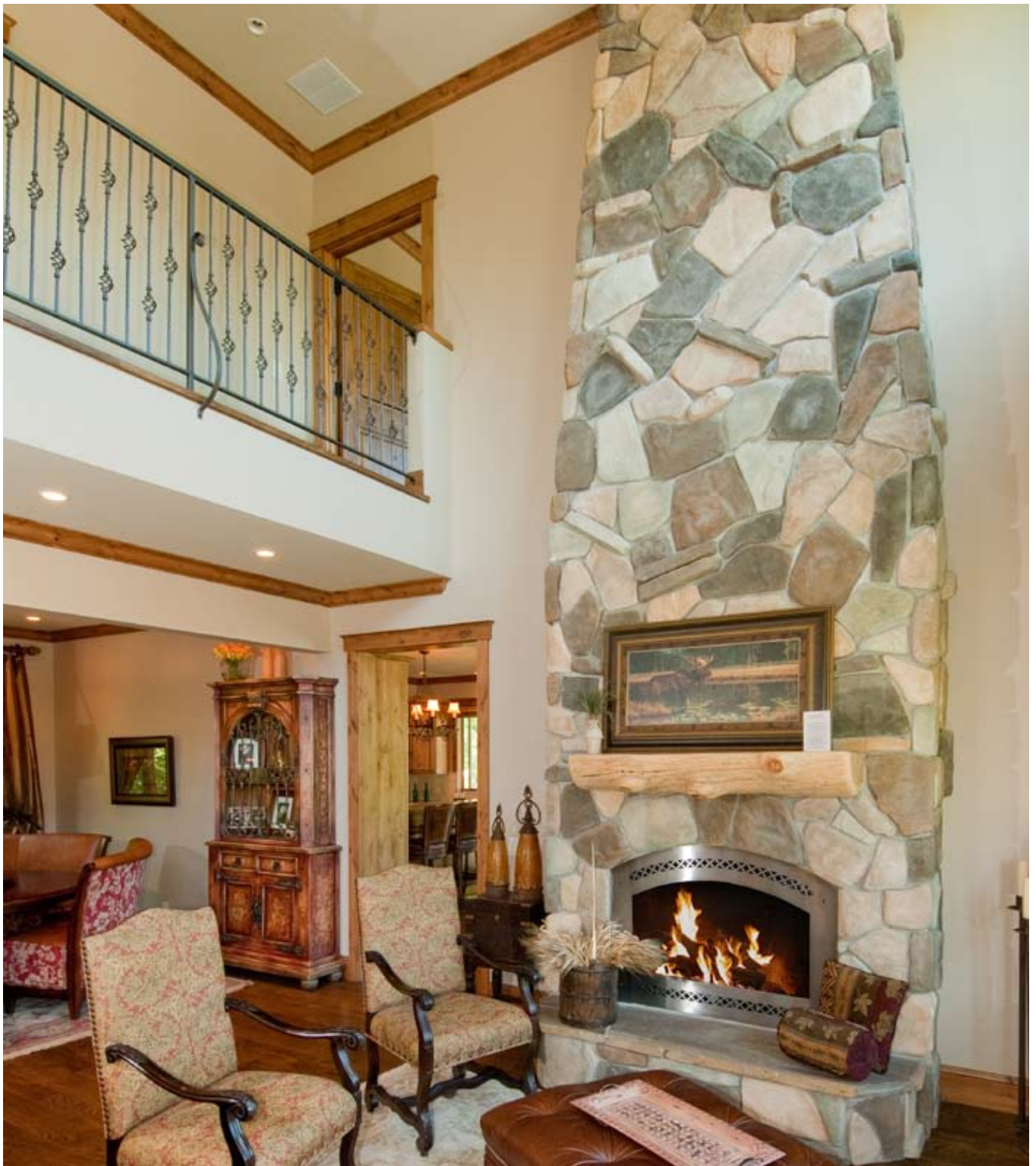
The beautifully appointed dining area features a striking chandelier and a custom table with bankette style seating.