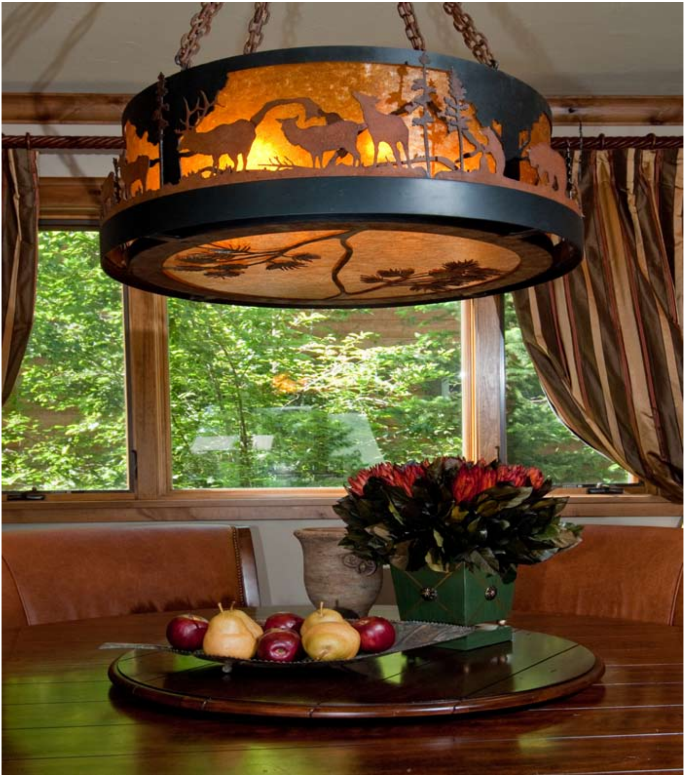
The beautifully appointed dining area features a striking chandelier and a custom table with bankette style seating.