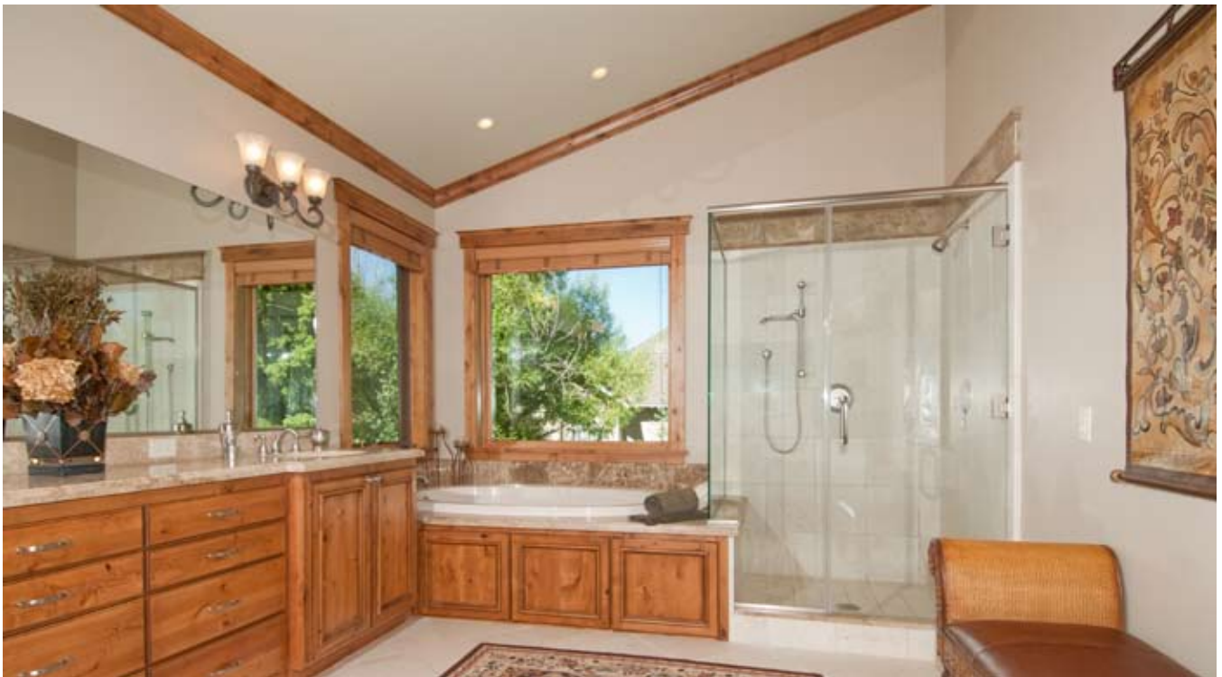
The master bath has granite counter tops, tile floors, his and hers sinks, a glass enclosed shower, oval tub and a large walk-in closet.